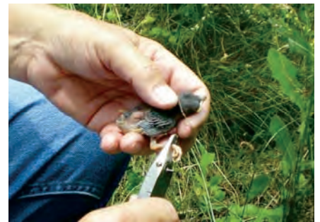
Above: Roland Bergner banding fledgling bluebirds at Skyline Commons Park