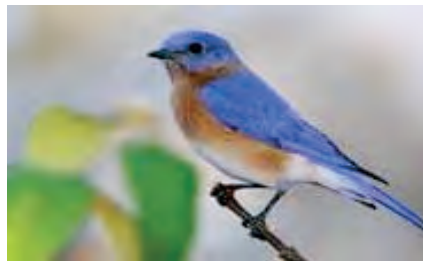
Eastern male bluebird

Want to help the Eastern Bluebird? Online information about Eastern bluebirds can be found at: