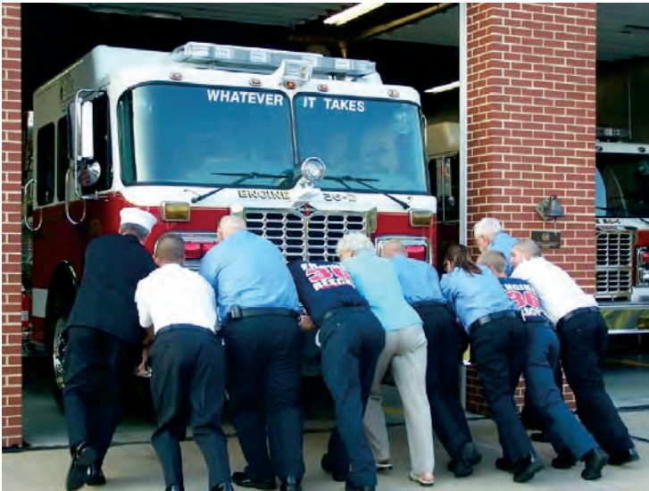
Traditional Housing Ceremony ends with the fire engine pushed back into the station.

The Township Building will be closed on Monday, September 6th for Labor Day; and Thursday November 25th & Friday November 26th for the Thanksgiving Holiday.