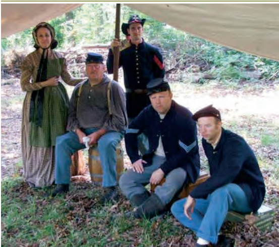
Civil War Living History Members

Homemade chicken soup, hot dogs and sausages, ice cream, soft drinks on draught, kettle pop corn and seasonal pies were enjoyed by everyone. The next big weekend of the anniversary will be August 27, 28 and 29, 2010 with a dance, community festival, parade, grove meeting and picnic.