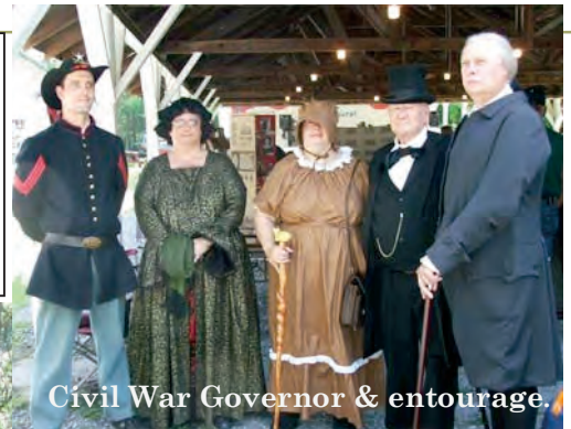
Civil War Governor & entourage.

HISTORY DAY July 17, 2010 Mt. Laurel Park